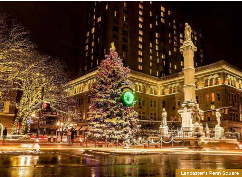
Lancaster's Penn Square