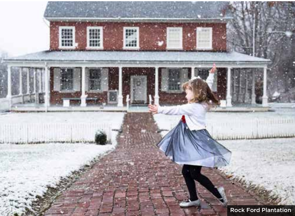
Rock Ford Plantation