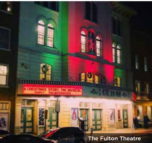
The Fulton Theatre