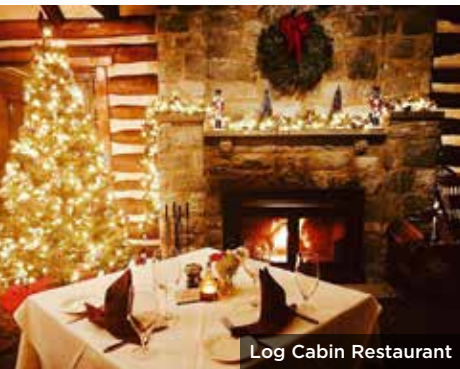
Log Cabin Restaurant

Twinkling lights, crackling fireplaces, swirling snowflakes in the air— the holidays are full of wonder. Whether you bring your whole crew, or are visiting for a weekend away as just the two of you, Lancaster County is brimming with cheer and charm. From family time strolling through the Sweet Lights of Hershey or Dutch Winter Wonderland, to spending quality time with your sweetheart over a romantic candlelight dinner you are sure to find some magical moments that transform into marvelous memories.