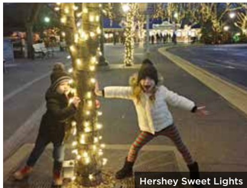
Hershey Sweet Lights