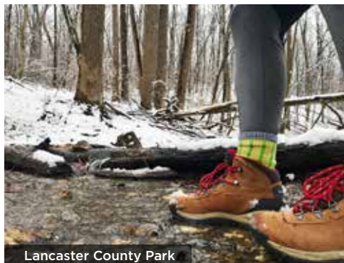
Lancaster County Park

Images from clockwise from top courtesy of @mmville_visuals, @mrottie, AvalancheXpress Snow Tubing